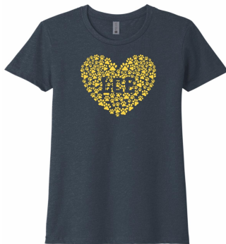
scoop neck t-shirt: $12

LCE Spirit Wear has arrived! T-Shirts, Hoodies, Hats and Jackets will be on sale Tuesday and Wednesday (11/9 & 11/10) in front of the school office from 2pm-3:30pm. Youth and Adult sizes available.