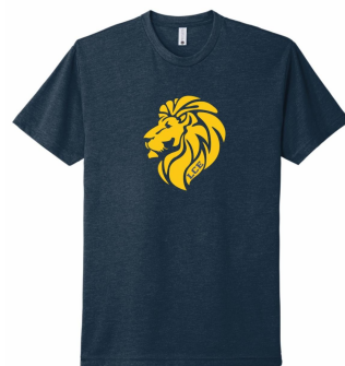
crew neck t-shirt: $15