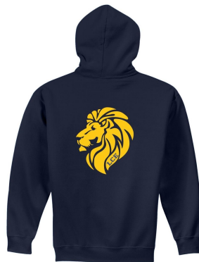
hoodies: zip up ($28 youth/$38 adult) pullover ($24 youth/$26 adult)